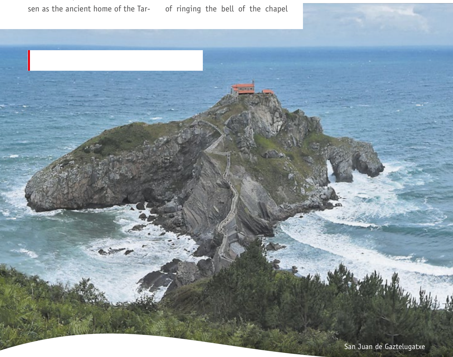
San Juan de Gaztelugatxe

three times and then, ask for a wish. The name of this medieval-style shrine in Basque means "castle made of rock" and it is precisely the special effects of the series that have turned it into a palace of stone to give life to one of the most important plots of the season.